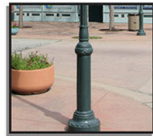
PROPOSED DECORATIVE TRAFFIC SIGNAL POLE (TYP)