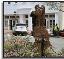
PROPOSED LOCATION FOR NEW OR RE-LOCATED PUBLIC ART INSTALLATIONS (TYP)