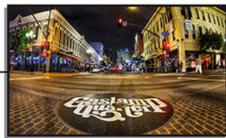
PROPOSED DECORATIVE PAVING IN INTERSECTION W/ OLD TOWN SALINAS DECORATIVE EMBLEM (TYP)