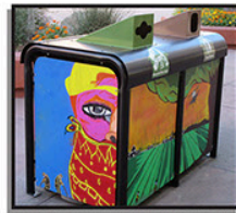
PROPOSED TRASH RECEPTACLE TO MATCH AND/OR COMPLEMENT EXISTING (TYP)