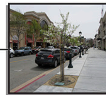
EXISTING STREETScape IMPROVEMENTS AT TAYLOR FARMS HQ BUILDING TO REMAIN (TYP)