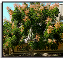
PROPOSED LARGE ACCENT TREE (TYP) Chinese Flame Tree ( Koelreuteria bipinnata )