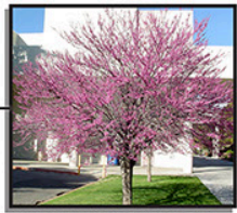
PROPOSED ORNAMENTAL TREE (TYP) Western Redbud ( Cercis occidentalis )