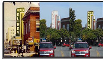
UPDATE AND/OR RENOVATE EXISTING THEATER MARQUEE WITH HISTORIC INSPIRED SALINAS BRANDING