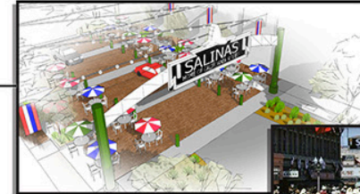
PROPOSED GATHERING AREA WITH HISTORIC INSPIRED GATEWAY SIGNAGE, FESTOON LIGHTING, CAFE STYLE SEATING AND REMOVABLE BOLLARDS (TYP)