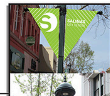
PROPOSED LED STREET LIGHTS WITH BANNERS OR HANGING POTS AT 50'-0" ON CENTER TO MATCH EXISTING (TYP)