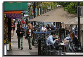
PROPOSED CAFE STYLE SEATING ADJACENT TO BUSINESSES, WHERE SPACE WILL ALLOW