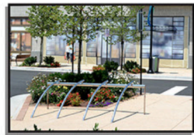
PROPOSED BIKE RACK TO COMPLEMENT DESIGN THEME (TYP)