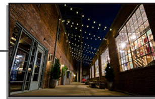
PROPOSED FESTOON LIGHTING AND ACCENT LANDSCAPING IMPROVEMENTS IN PEDESTRIAN ALLEYWAYS (TYP)