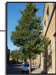
PROPOSED STREET TREE (TYP) Calkey Pear ( Pyrus calleryana )