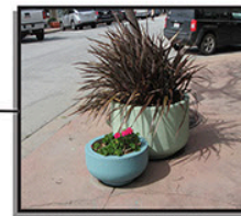
PLANTING POTS TO BE SUPPLIED BY LOCAL BUSINESS OWNERS IN COLORS AND STYLES COMPLEMENTARY TO THE ESTABLISHED DESIGN THEME (TYP)