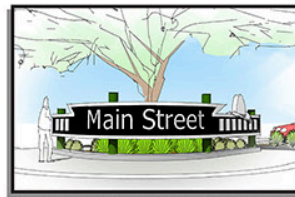
PROPOSED CORNER IDENTITY WAYFINDING MONUMENT (TYP)