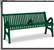
PROPOSED BENCH TO COMPLEMENT DESIGN THEME (TYP)